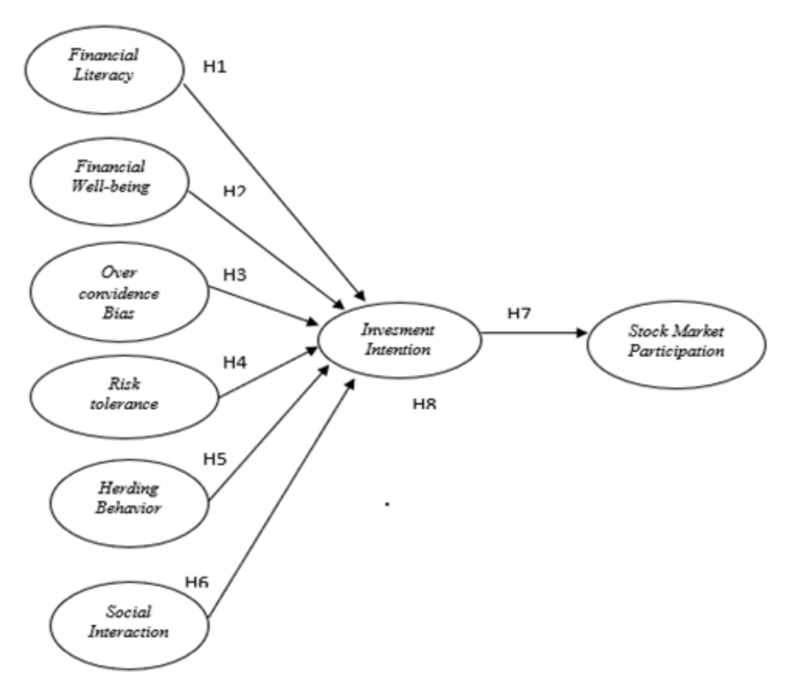
Figure 1. Research Model