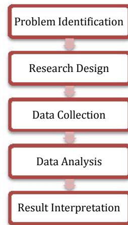
Figure 3. Research Process