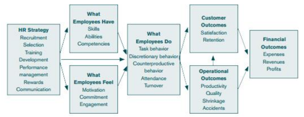
Figure 2.1 Strategy Human Resource Strategy and Performance (Patrick, 2008)