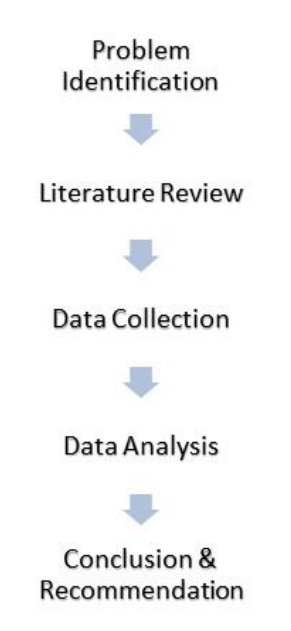
Figure 3.1 Research Flow

For Methodology Design, there will be divided into several steps that will be implemented in doing the research.