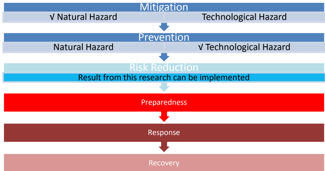
Figure Error! No text of specified style in document..1 Curently condition Disaster Managemnt at Shafco

After doing risk calculation with two approaches and getting some fact/data from result by interview and questionnaire, the researcher give some recommendation for Shafco, that has aware for disaster management and already do some stage in disaster management if seen using stages of disaster management according to Rina Tnunay (Tnunay, What is disaster management?, 2013). If the condition describes: