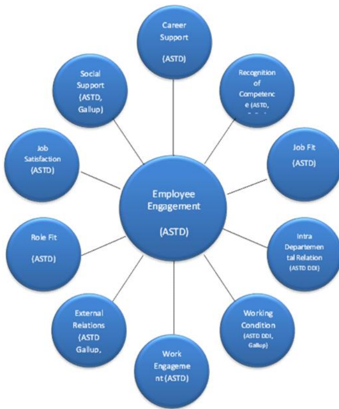
Figure 1 Conceptual Framework

Social Support, Job Fit, Role Fit, Career Support, Recognition of Competence, Intra Departmental Relation, External Relation, Working Condition, Job Satisfaction, and Work Engagement. Figure that will explain this research's framework of employee engagement can be seen in figure 1.