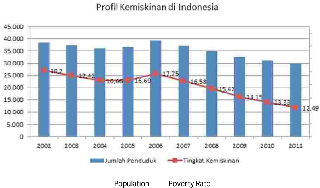
Figure 1. 1. Poverty Rate In Indonesia

Satoe Indonesia aims to contribute significantly to the development of a better society in Indonesia. We believe that to create a better society, we must increase every important aspect of life that would lead to the independence of the community. To achieve community independence, Satoe Indonesia develops community with several programs in the fields of education, health, and organizational leadership, entrepreneurship and prosperity.