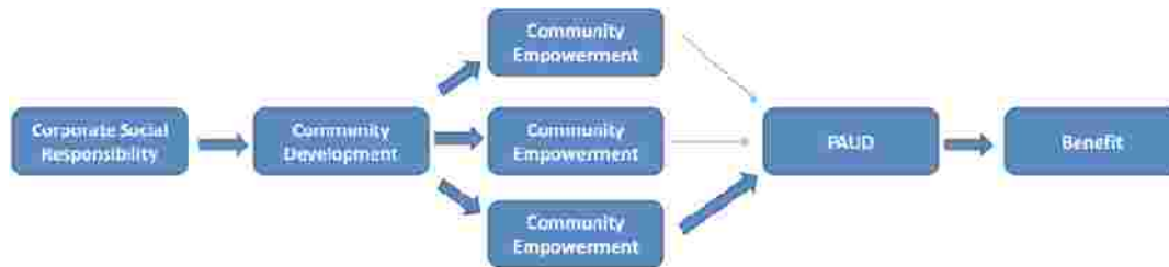
Figure 2. 1. Conceptual Framework

Most research reports cast the problem statement within the context of a conceptual framework. A conceptual framework is used in research to outline possible courses of action or to present a preferred to an idea or thought